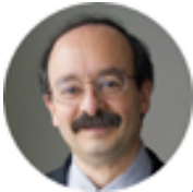
AMORY LOVINS , Chairman and Chief Scientist of the Rocky Mountain Institute Reinventing Fire